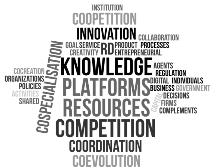
Figure 2: Innovation ecosystems word cloud based on abstract and key words, top words

concept most frequently used in the abstracts and keywords of these papers. The word cloud of Figure 2 indicates a strong link with the other concepts of ecosystem (business and entrepreneurial) and the “co-”concepts (co-creation, competition co-evolution, and so on).