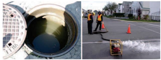
Figure 1. Flooded air-vacuum valve vault.

where Q_i = intrusion flow; C_d = coefficient of discharge; D = orifice diameter; g = gravitational acceleration; H_{\text{ext}} = external head on pipe; and H_{\text{int}} = internal line pressure. For intrusion using a leakage rate, the intrusion flow at a node is computed when the external head value (head of water above pipe – which is fixed by the user) is above the internal pipe pressure value. The leakage factor is used to set the size of the orifice. A leakage value of 20% was simulated along with an exit (or external) head of 1.4 m (2 psi). When computing intrusion volumes through pipe leaks, it was assumed that none of the air-vacuum valves were submerged and these were modeled as surge protection devices. In the model, as their actual sizes were unknown, the air-vacuum valves were sized using the AWWA rule of thumb, which recommends a 25 mm inlet size per 300 mm of pipe diameter (AWWA, 2004). Resulting inlet diameters of 25, 50, and 75 mm were obtained. For simulating intrusion through submerged air-vacuum valves, all air-vacuum valves located in the network studied area ( n = 30 ) were assumed to be submerged under 0.5 m of water in the vault. A flooded vault is illustrated in Fig. 1.