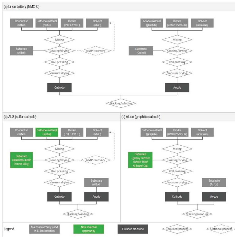
Figure 2. Electrode production requirements for (a) a Li-ion battery with NMC cathode and graphitic anode; (b) an Al-S battery with sulfur cathode and aluminum anode; and (c) an Al-ion battery with graphitic cathode and aluminum anode. Abbreviations: NMC—lithium nickel-manganese-cobalt oxide, PTFE—polytetrafluoroethylene, PVDF—polyvinylidene difluoride, NMP— N -methyl-2-pyrrolidone, CMC—carboxymethyl cellulose, PAA—polyacrylic acid, and SBR—styrene butadiene rubber.